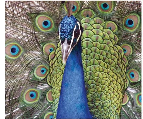
Original master/ artwork

Converting pictures successfully into a real glass mosaic image is our mastered technique of workmanship and skills. The sophisticated product and color range of glass mosaics, also available various sizes, allow the incorporation of fine nuances.