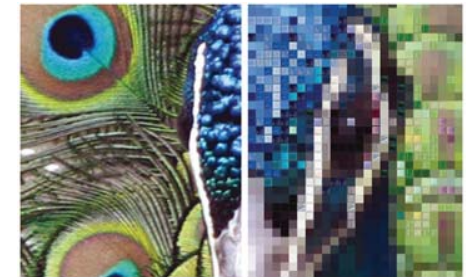
Creative mosaic artwork